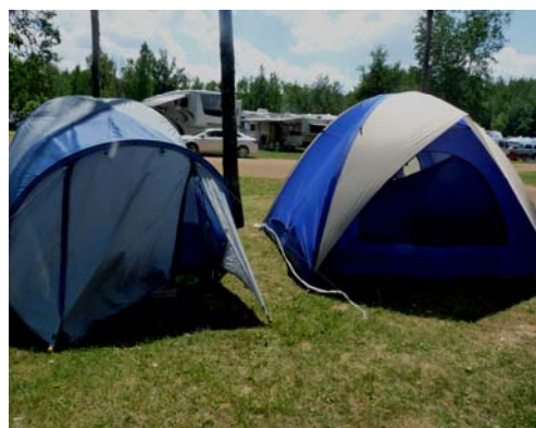
Tents at Family Camp