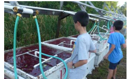
Boys helping with cherries

will be able to raise an additional $625 per month.